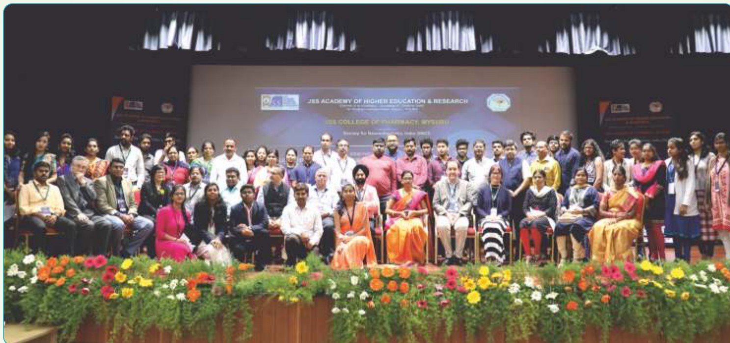
International conference at Sri Rajendra Auditorium, Mysuru

held at Sri Rajendra Auditorium , JSS College of Pharmacy, Mysuru on 14th – 16th, March 2019