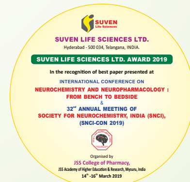
Suven Life Sciences Award Plaque prepared by CIIMS