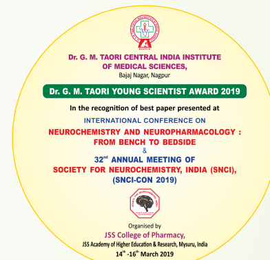
Dr. G. M. Taori Award Plaque prepared by CIIMS

Nagpur chapter designed and prepared two Award Plaques for Dr. G.M. Taori Award Plaque & Suven Life sciences respectively under the guidance of President, secretary & Joint secretary of the society. First time the award plaques were given to the first winner of the oral and poster session along with certificate and cash price during Mysore meeting held in March 2019 .